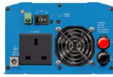
Phoenix Inverter 12/800 with BS 1363 socket