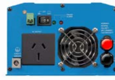
Phoenix Inverter 12/800 with AN/NZS 3112 socket