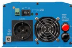
Phoenix Inverter 12/800 with Schuko socket