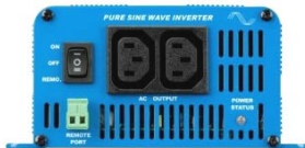
Phoenix Inverter 12/350 with IEC-320 sockets