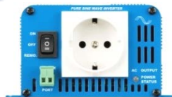
Phoenix Inverter 12/180 with Schuko socket