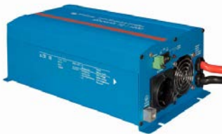
Phoenix Inverter 12/800 with Schuko socket

For our lower power models we recommend the use of our Filax Automatic Transfer Switch. The Filax features a very short switchover time (less than 20 milliseconds) so that computers and other electronic equipment will continue to operate without disruption.