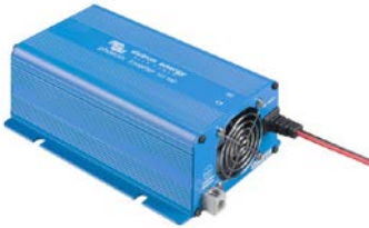
Phoenix Inverter 12/180