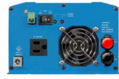
Phoenix Inverter 12/800 with Nema 5-15R socket