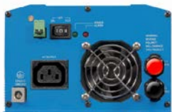
Phoenix Inverter 12/800 with IEC-320 socket